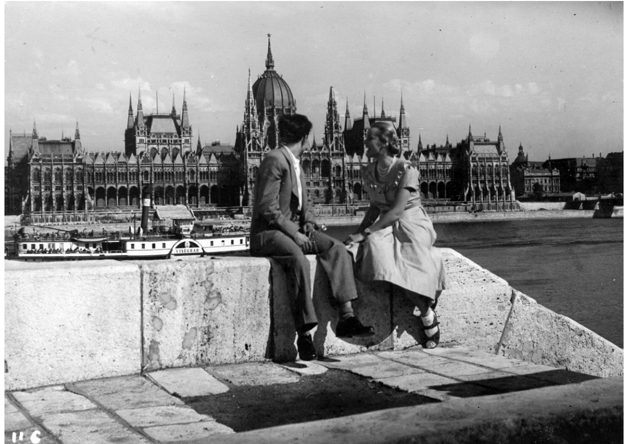
Standfotó a Nyugati övezet című filmből - Film still of Nyugati övezet feature film by Csépany Sándor - National Széchényi Library (OSZK) Budapest, Europe - CC BY-NC-ND.

The result is over 500 new tags added to over 100 heritage photographs.