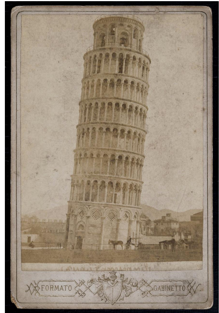
img. Promoter Digital Gallery

On the occasion of the first CitizenHeritage Multiplier Event held in Pisa, a digitization and collection desk was organized, inviting participants to share heritage photos from their family albums, which were digitized on the spot by a professional photographer, and then aggregated by Photoconsortium and published in Europeana, the European digital library. An evaluation survey was submitted to the participants to understand their thoughts about sharing personal heritage in the context of an open science approach.