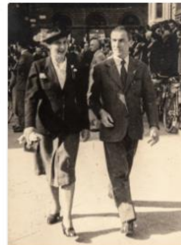
Couple walking in the city - Coppia a passeggio in città