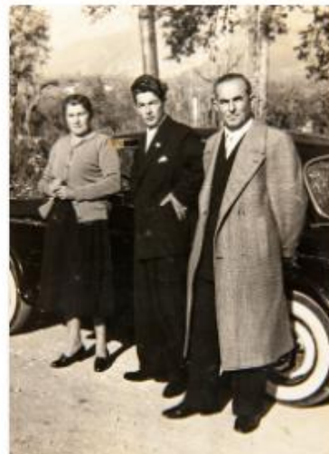
The groom with his parents - Sposo con i genitori