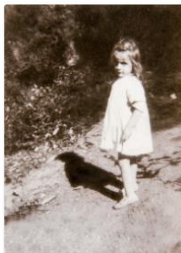
Portrait of a little girl - Ritratto di bambina