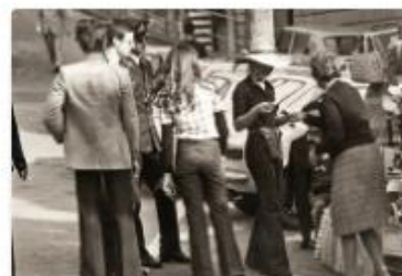
Buying a hat - Mi compro un