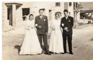
Two weddings - Due Matrimoni