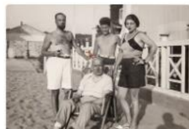
At the beach - Al mare