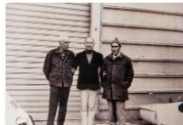
Seaman in Porto S. Stefano #2 - Uomini di mare a Porto S. Stefano #2