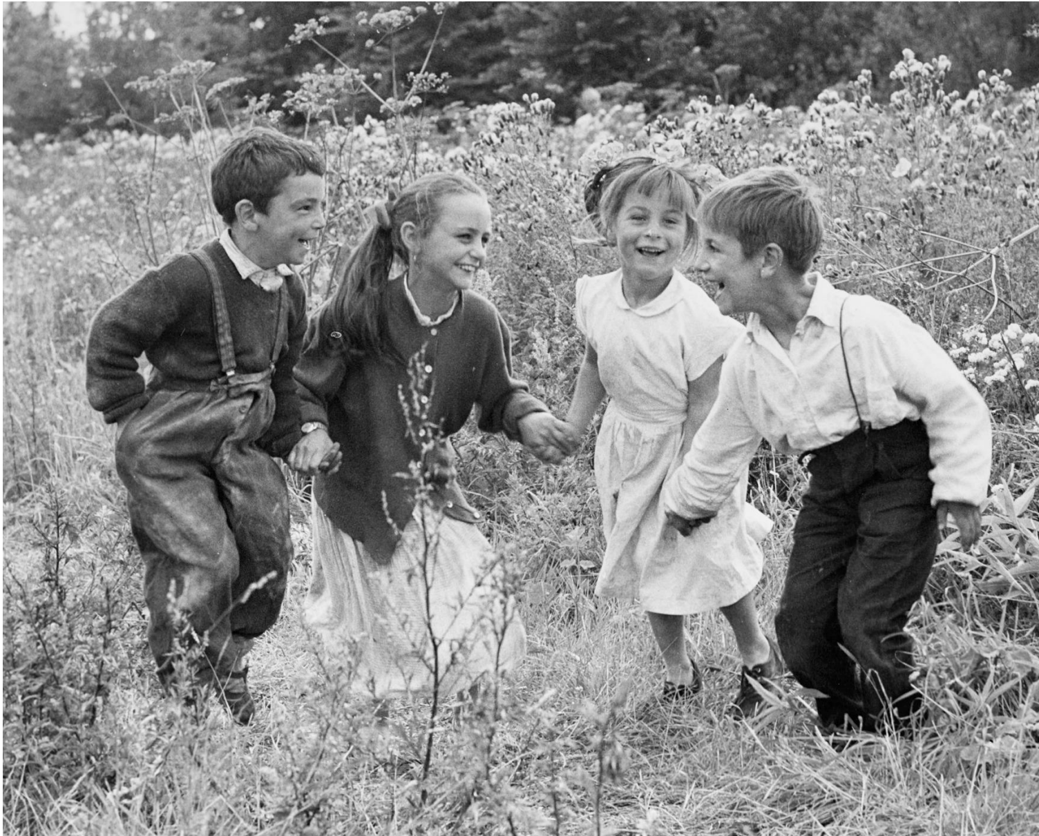
2002238: New Cobham Roma Site - Kent , England - 27 August 1962.