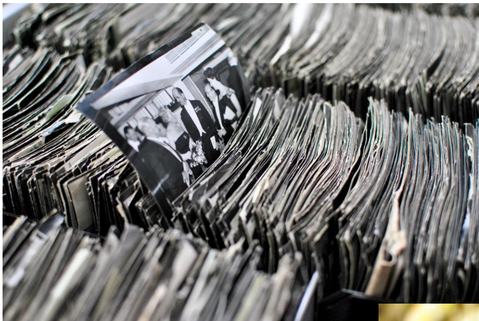
Contact prints and glass plate negative boxes at the TopFoto archive.