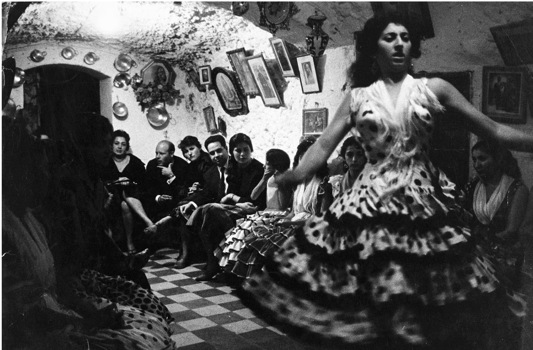
2002425: Granada " Zambra gitana " at " Las Golondrinas ", one of the most typical of the Roma " caves " on the Sacromonte hillside , Spain

Weave Widen European Access to Cultural Communities Via Europeana