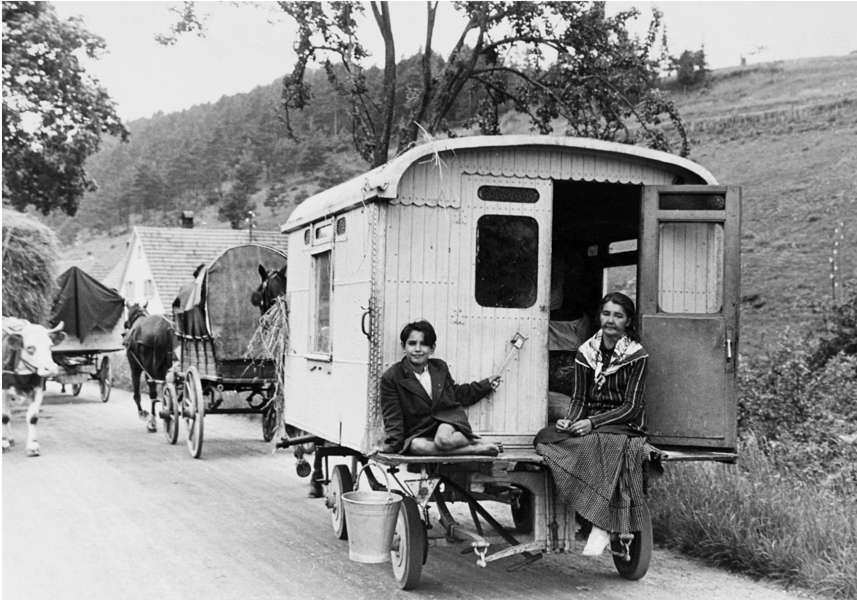
2002215: In all weathers the Roma are on the road, travelling day after day, week after week, breaking their journey here and there to work or entertain.