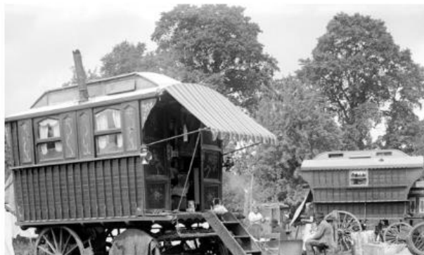
WEAVE GRT 2