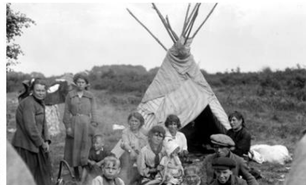
WEAVE GRT 3