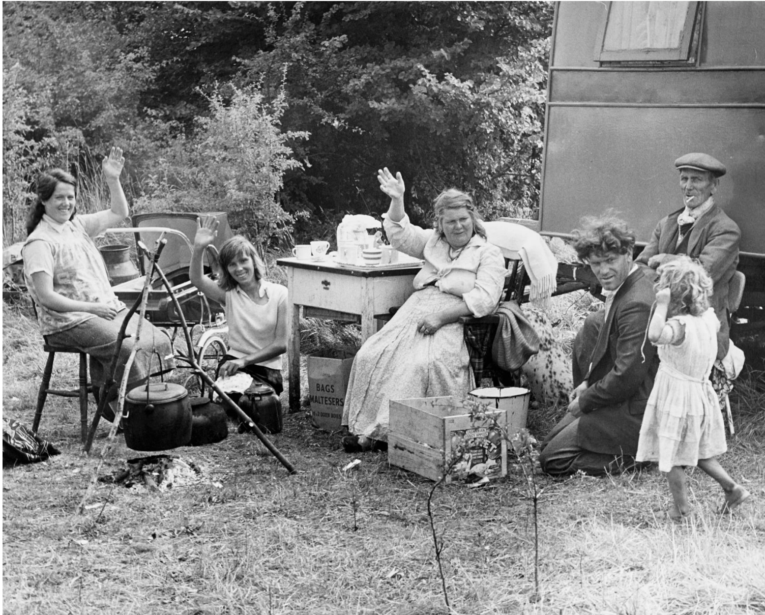
2002239: New Cobham Roma Site - Kent , England - 27 August 1962.