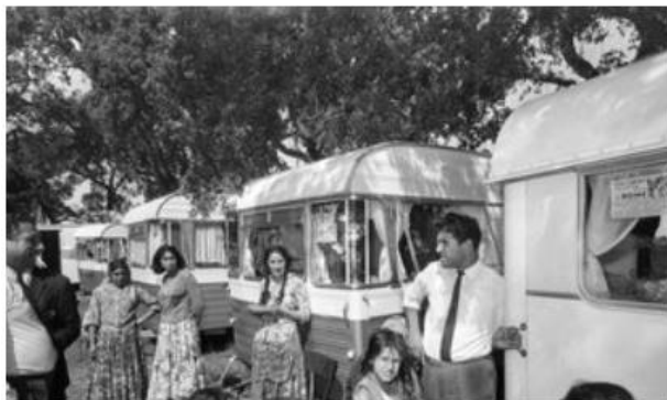
WEAVE GRT 1